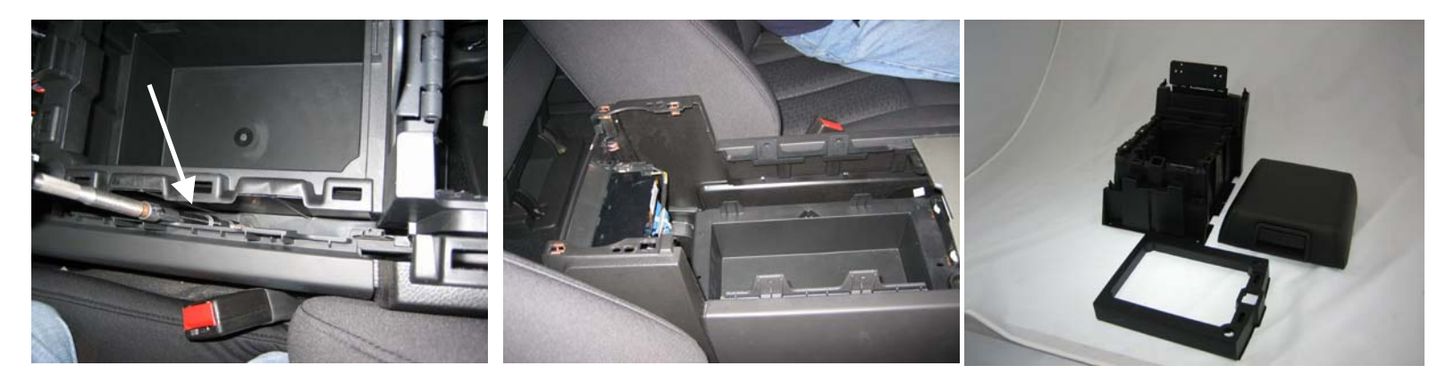
Remove hex head screws holding lower sides accessory pocket